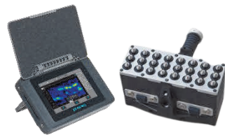
Pundit® 250 Array