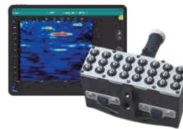
Pundit® PD8000 Basic