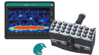
Pundit® PD8000 Pro