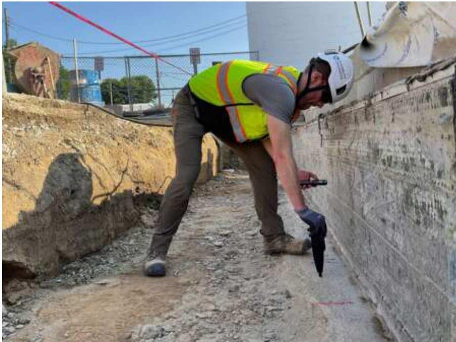
Durability Engineers onsite using the Silver Schmidt Hammer