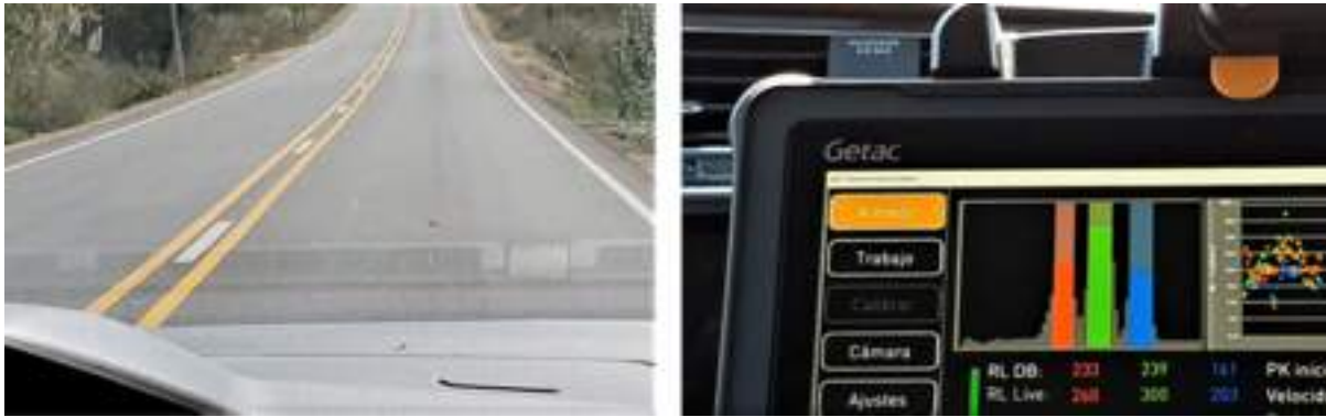
Example of a road with triple road markings (left) and the results as seen live on ZDR6020 software (right).

Zehntner ZDR6020 is able to measure the retroreflectivity of three lines simultaneously. This is important for airports since such line patterns are common.