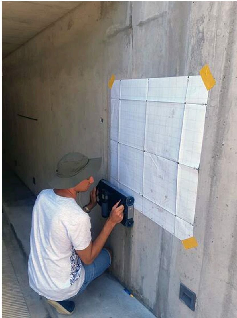
Using the GP8100 to collect an area scan