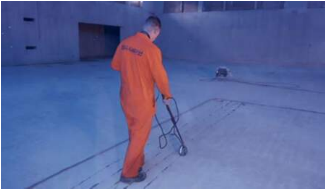
Performing half-cell potential measurements on the concrete floor with the Profometer PM8500 corrosion sensor

Because of the presence of some damages in the floors and the knowledge that the floors had been exposed to thaw salts driven in by cars for about 40 years, it was suspected that the corrosion problem in the floors was possibly much more serious than it appeared. Potential measurements in such a situation can provide relatively quick answers about the presence of reinforcement corrosion in the entire floor area (over 1400 m 2 , spread over three split-level parking levels).