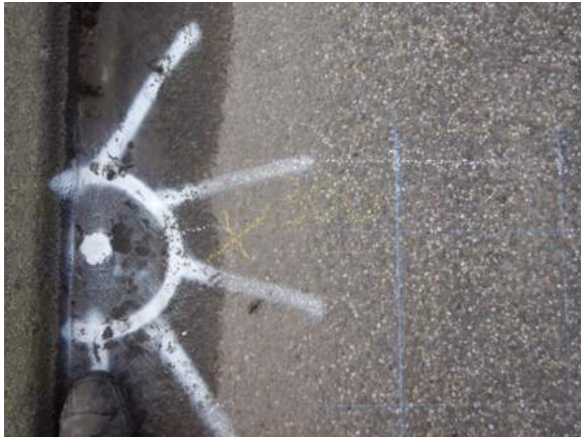
The indicated position for the light poles

Ten Thije, decided to make an area scan on the asphalt road and correlate the GPR measurements with historical drawings and the beams that were visible under the bridge. All the locations had GPS coordinates.