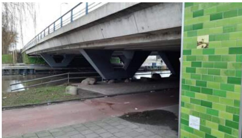
Side view of the bridge and drawings with indications of GPR data collection

The municipality of Utrecht wanted to redesign a road containing a small bridge, where some light poles had to be moved. Screening Eagle's customer, Ten Thije, was contracted to check whether the new locations for the light poles contained prestressing reinforcement.