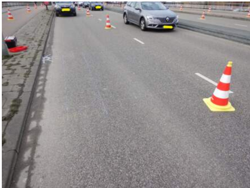
Traffic is a concern when working on bridges

The crucial part of an investigation over a bridge is the limited time you have to work on the site. Limiting the traffic or closing the bridge usually costs money to the bridge administrator and so GPR is a convenient method as it collects data fast, without causing any damage to the bridge.