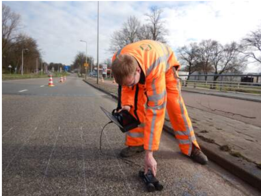
Using the Profometer on the bridge

The crucial part of an investigation over a bridge is the limited time you have to work on the site. Limiting the traffic or closing the bridge usually costs money to the bridge administrator and so GPR is a convenient method as it collects data fast, without causing any damage to the bridge.