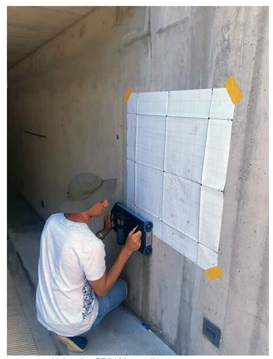
Using the GP8100 to collect an area scan