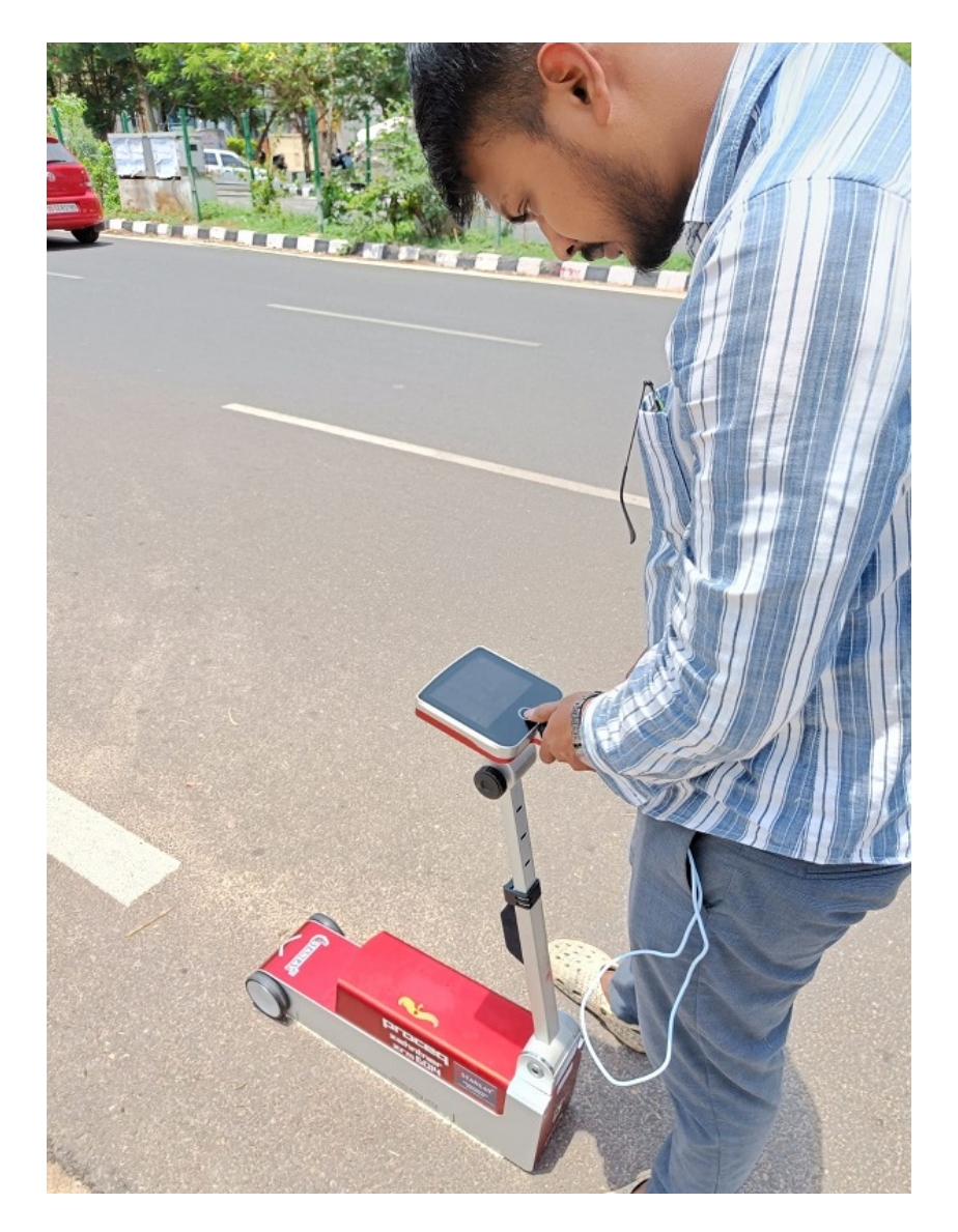
Enabled with 5.7" high-resolution color touchscreen, the retroreflectometer offers excellent visibility under all light conditions. The retroreflectometer logs all measurements with precise geolocation & provides comprehensive reports quickly with the help of user-friendly reporting software at ease.